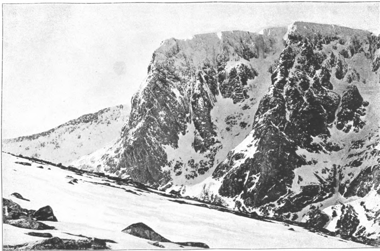
BEN NEVIS, CLIFFS FROM N.E. BUTTRESS TO TOWER RIDGE